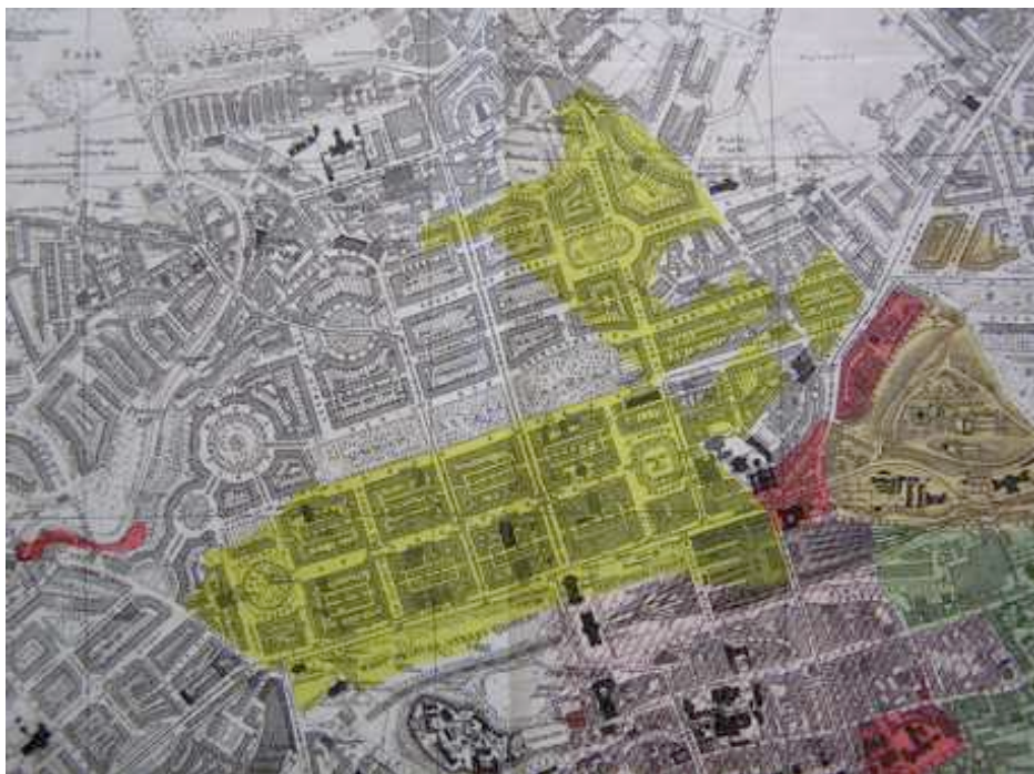
Map showing land acquired by Edinburgh Common Good Fund to construct the New Town (yellow), Common Good land of Calton Hill (brown) and Royal Burgh (red hatch).